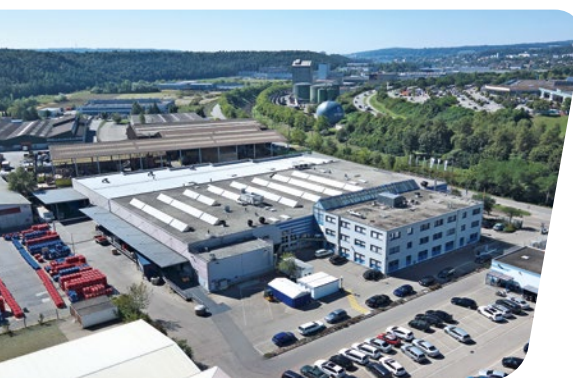
CONICA AG, Schaffhausen, Switzerland