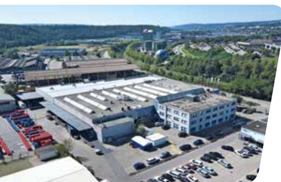
CONICA AG, Schaffhausen, Switzerland