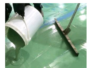
filling with coating