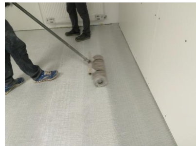
rolling transverse to the length

After waiting for 10 minutes the surface needs to be rolled over with a roller of at least 70 kg weight . The rolling has to be done cross-wise , starting transverse to the length allowing the air to move out at the small side. Then roll along the length and finish by rolling across again.