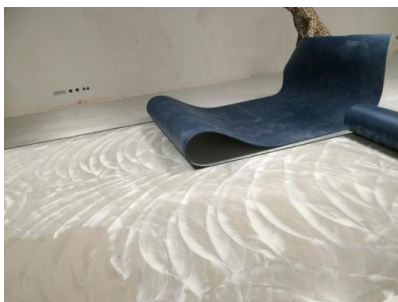
laying of the mat into adhesive

The adhesive needs to ventilate for approximately 10-15 minutes , before the foam mat is laid with the glass fibre facing the top into the glue and cut into the final length.