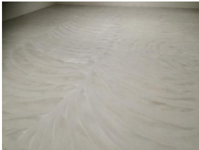
surface with levelling compound

The levelling filler Uzin NC 160 is applied with a bigger trowel. Depending on the roughness of the substrate the consumption is approximately 1.5 – 2.5 kg/m 2 per mm filling of unevenness.