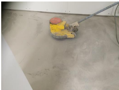
grinding of the surface

Depending on the climatic conditions / used filler / quantity of the filler the curing will take up to 24 hours . After curing, the surface needs to be ground with a disc-type sander using abrasives with a grit of 16, 24 or 36. Afterwards the surface is cleaned with a vacuum cleaner , removing the dust completely.