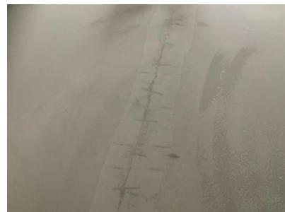
prepared construction joint

The screed must be ground or shot-blasted. If there are construction joints, armoured cuts have to be made, armoured irons laid and the joints friction-locked with epoxy resin and sanded.