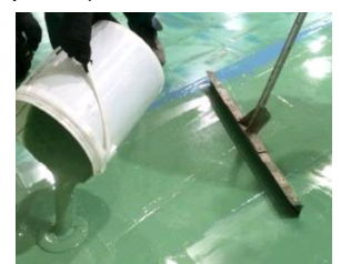
filling with coating